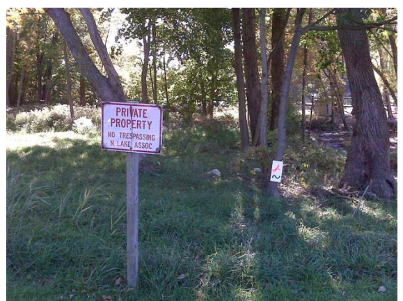
As you approach and as you drive by

How could we have done this right in the instructions? ORIGINAL: